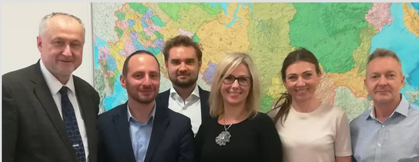
SZKOLENIE Z ZARZĄDZANIA WYNIKAMI BADAŃ DLA RUSADA